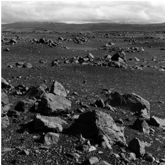
Fig.3: Typical sandur morphology with gullies and "rock gardens"

provide ground truth and therefore greatly improve our understanding of endogenic and exogenic processes which led to the formation of the rocks exposed on the surface. Rovers, allowing to look at rocks of interest under different viewing angles and analyzing these rocks geochemically are also very helpful (see Sojourner) but cannot replace detailed in-situ investigation by human beings.