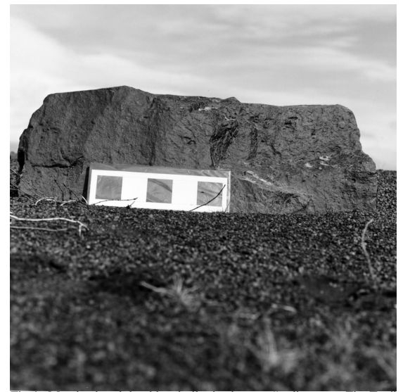
Fig.4: Massive basalt boulder similar in shape to "sedimentary Flat Top" (scale is 25 cm)